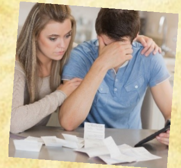
Fairport Good Neighbor Fund