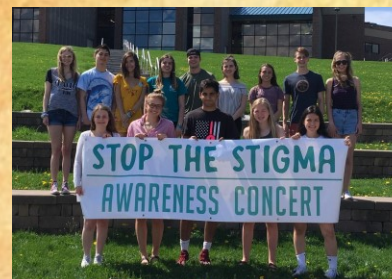
Stop the Stigma ROC