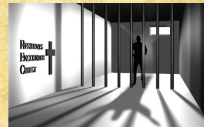
Prison Ministries of Upstate New York