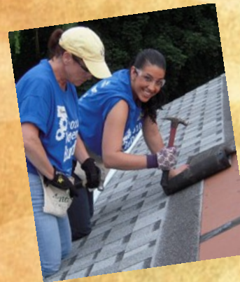
Perinton Congregations for Flower City Habitat for Humanity